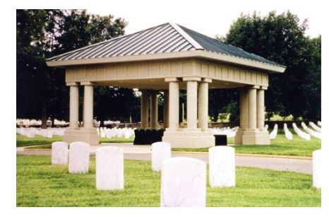
commital service shelter