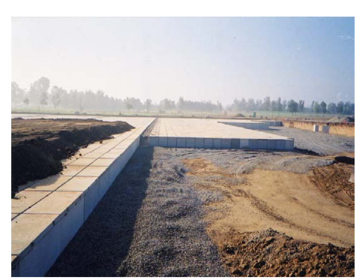
crypts (4,370)full casket (230)