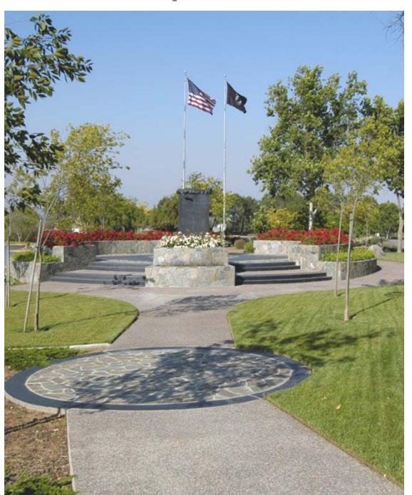
memorial w/ donor wall