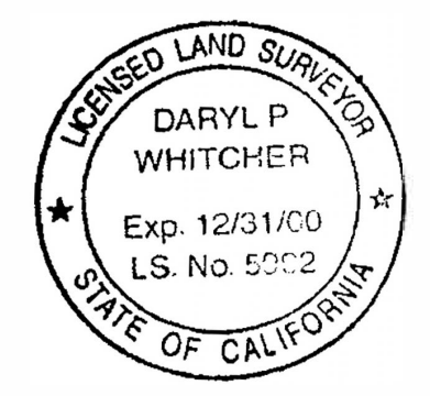
CJD/cd 07/14/98 /cjd/ayh-ld.wpd