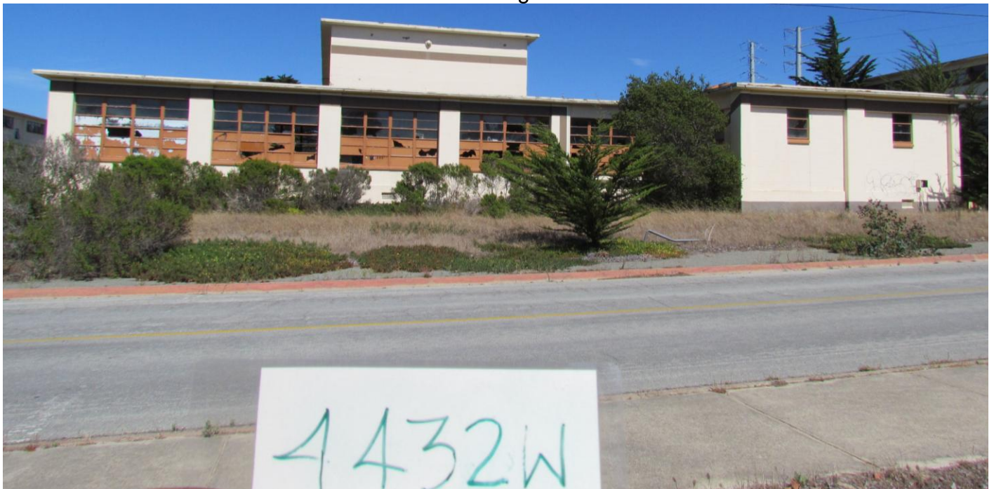
HH-4432 Existing Site: sht 2

Phone: (831) 883-3672 • Fax: (831) 883-3675 • www.fora.org