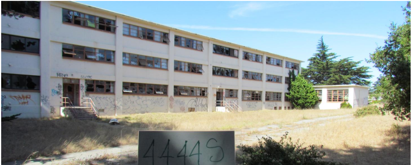
HH-4444 Existing Site: sht 2

Phone: (831) 883-3672 • Fax: (831) 883-3675 • www.fora.org