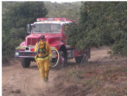
Fire engines received by Fire Departments in the Cities of Marina, Monterey and Seaside and the Ord Military Community were utilized during the Parker Flats habitat burn in 2005

This lease purchase of equipment accommodated FORA's capital obligations under the BRP to enhance the firefighting capabilities on the former Fort Ord in response to proposed development. The lease payments began July 2004, and will be paid through were retired in FY 2013/14. Once Now that the lease payments, funded by developer fees, have been satisfied, FORA's obligation for fire-fighting enhancement will have been fully met. FORA transferred equipment titles to the appropriate fire-fighting agencies in April 2014.