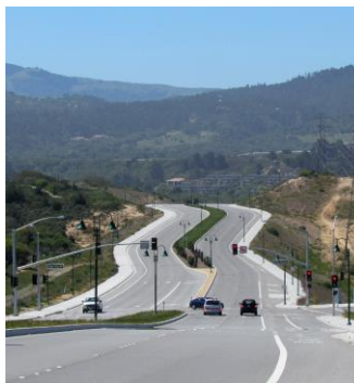
General Jim Moore Boulevard at Hilby Avenue; one of three intersections upgraded/opened in the City of Seaside

The FORA Board subsequently included the Transportation/Transit element (obligation) as a requisite cost component of the adopted CFD. As implementation of the BRP continued, it became timely to coordinate with TAMC for a review and reallocation of the FORA financial contributions that appear on the list of transportation projects for which FORA has an obligation.