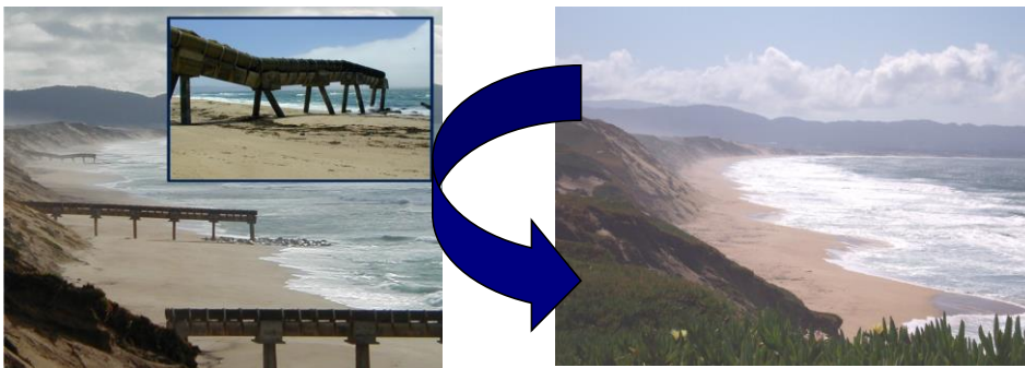
Storm drainage outfall removal – Before and After

In the future, following build-out of on-site storm water disposal facilities, FORA or its successor will remove, restore and re-grade the current, interim disposal sites on CDPR lands. The cost of this restoration is currently unknown and therefore presented as a CIP contingency.